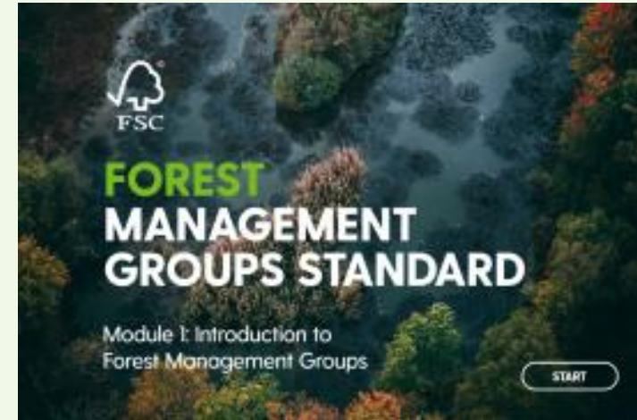
Forest Management groups