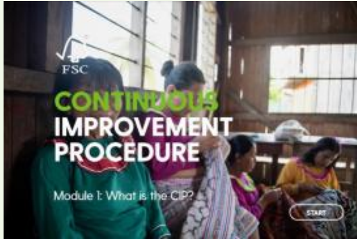
Continuous Improvement Procedure